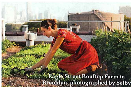
Eagle Street Rooftop Farm in Brooklyn, photographed by Selby