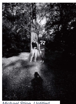
Michael Stipe, Untitled

Stipe's exhibition, Even the birds gave pause , takes imagery from his most recent book published by Damiani of the same name as the foundation and expands from there. The artist's continual exploration of portraiture is the show's central theme. Stipe's portraits reflect a variety of different approaches - candid, conceptual, and classical - but always with a poignant sensitivity to the vulnerability of his subjects. The curation of images and objects presents a view into how the artist sees and interprets the world around him. This is Stipe's first exhibition with the gallery.